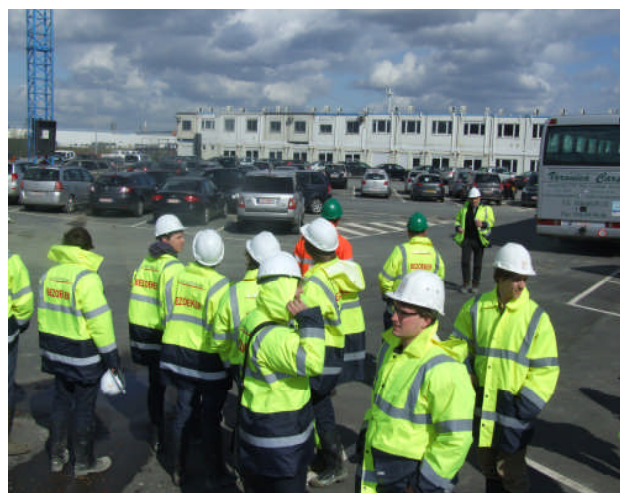
Railway tunnel between Left en Right banks under construction: port of Antwerp

In total 66 participants learned everything about the future of the port and especially on the left bank.