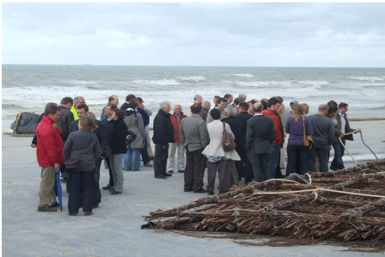
PIANC-AIPCN.be members and the sea: united

Vrijhavenstraat 3 – B 8400 Oostende Bank: 001-2385930-97 Web: http://www.pianc-aipcn.be