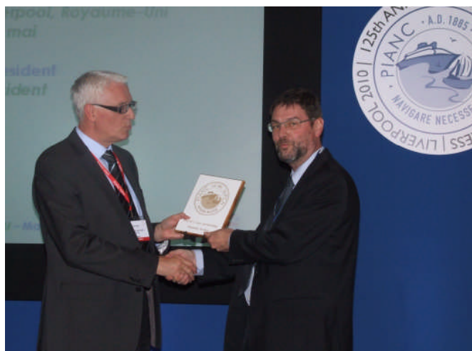
PIANC - Belgium received the BP award

The highlight of 2010 was of course the international conference in Liverpool.