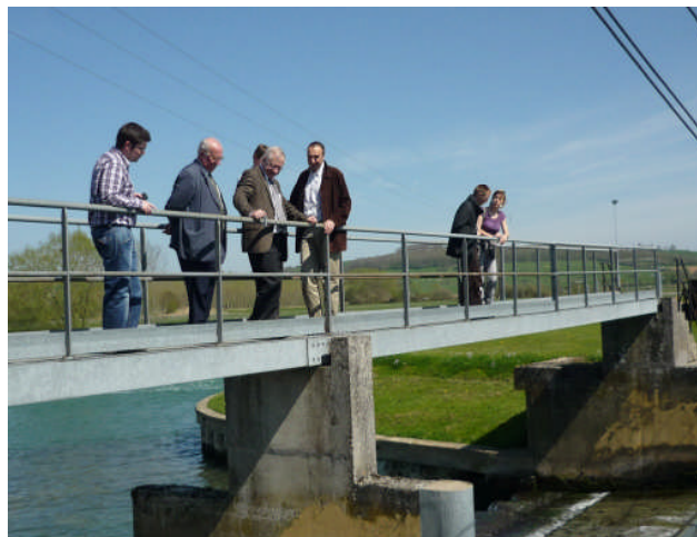
Barrage gonflable : Villers-devant-Mouzon

On June 24, the renovation of the “Van Cauwelaert lock” in the port of Antwerp was visited by 42 members. This lock, built in 1928 is undergoing a complete restoration with the construction of new doors.