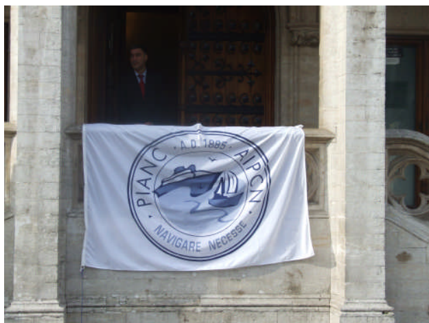
Town hall of Brussels during the PIANC event.

On March 18, PIANC-Belgium organised its annual general assembly. In 2010 it was the Brussels region that organised the meeting in the world famous town hall of the city of Brussels.