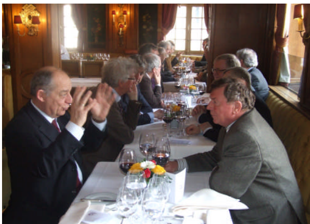
Lunch in a typical brasserie.