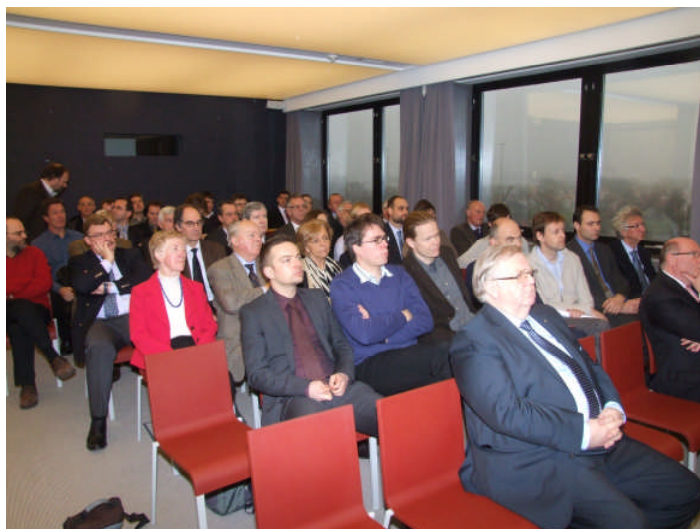
PIANC-AIPCN members during the session.

PIANC-Belgium started the year 2010 on January 13 with the traditional culinary walk, this time in the city of Ghent, organised by the Belgian Youngsters. 18 gourmands participated in it.