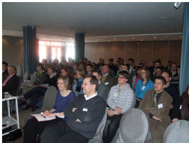
Railway-tunnel port of Antwerp : Liefkenshoektunnel. Symposium port of Antwerp: Waaslandhaven-Beveren.