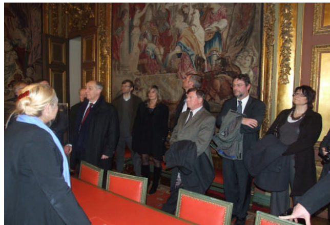
Cultural visit of the town hall.