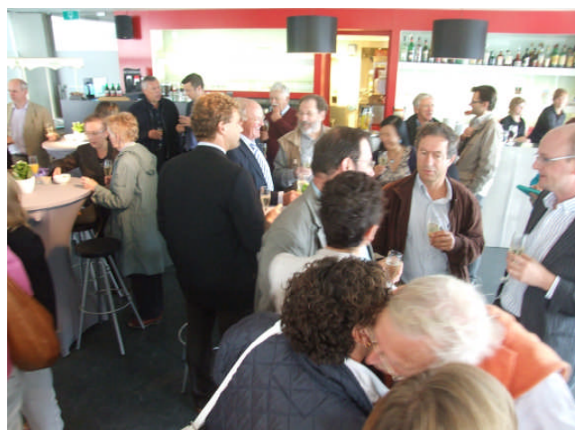
New Harbour entrance to the port of Ostend under construction. Before the BBQ started.

On November 8, CERES and PIANC-Belgium organised a second technical evening. This time the subject was “Le projet Seine Escaut Est en Wallonie”.